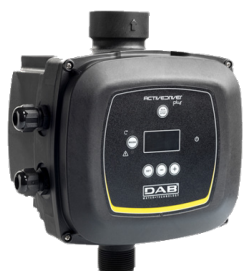
3 x ACTIVE DRIVER PLUS